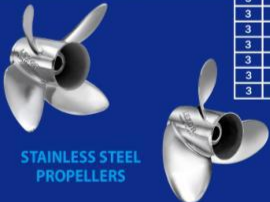
STAINLESS STEEL PROPELLERS